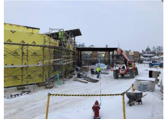
The addition exterior scaffolding being installed for the masonry façade work to begin