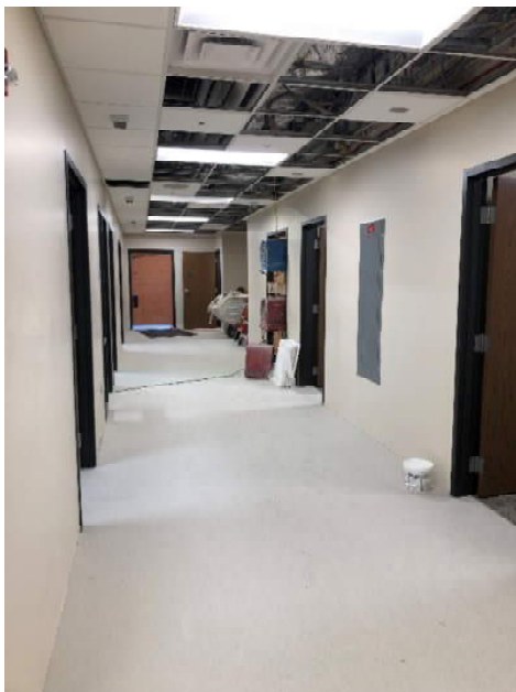
The main corridor of the Imaging Suite is being cleaned up and ready for ceilings tiles to be dropped.