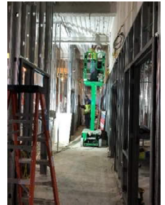
Various views of the framing and MEP rough ins down the long corridors of the lower level Clinic / Med Surge addition