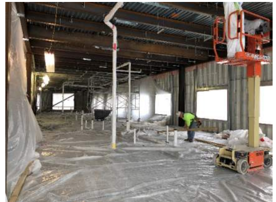
Upper level of the addition with a plastic protection installed to allow fireproofing to be installed