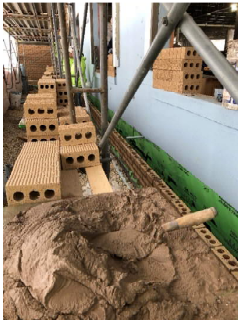
On the exterior of the courtyard, Findorff masons work in a covered scaffold shelter to install the brick façade. A work station is pictured on the left with a trowel in some fresh grout and the left picture shows how the bricks get stacked together.