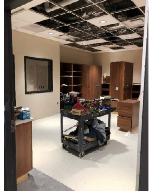
The CT room is coming together with millwork installation