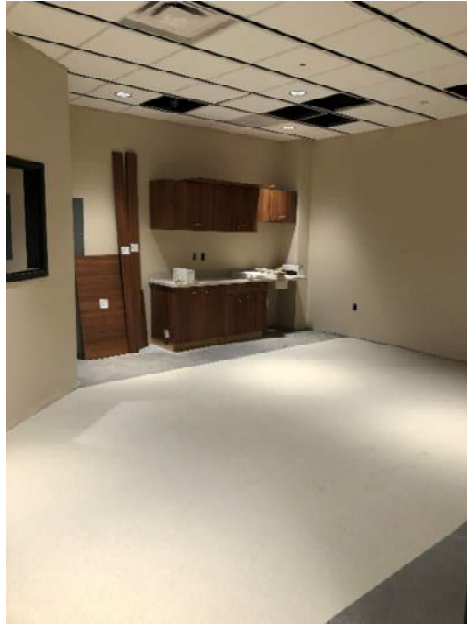
Only a few ceiling tiles remain out in the Fluoro room as the above ceiling punch list items are being completed