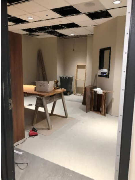
A view into the X-Ray room which is currently where the saw horses used for carpentry cutting reside