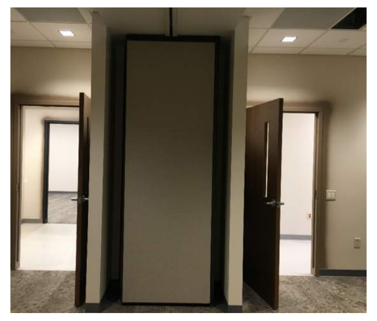
Folding partitions were installed in both of the classrooms down in the Education area. These will help separate the rooms to allow for multiple groups to work at one time.