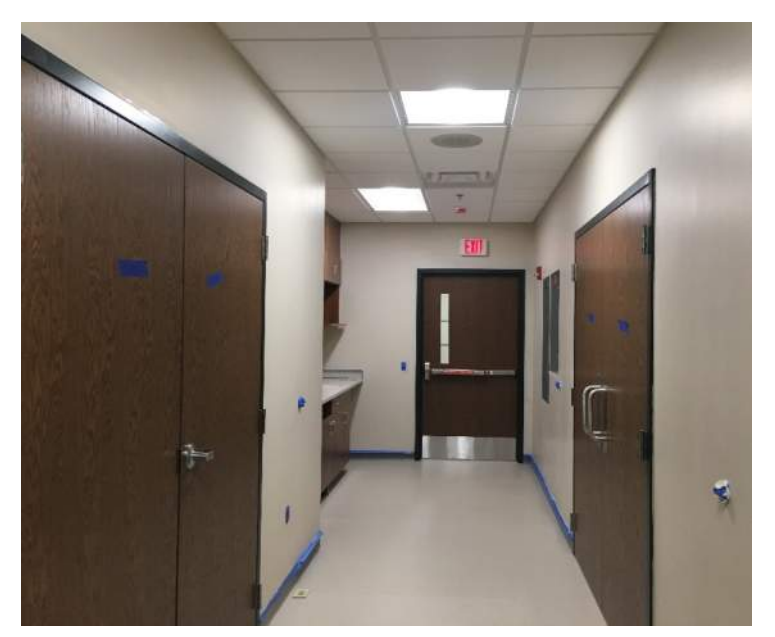
A view down the hall of the Education area that will open up to the existing facility in the lower level Clinic area.