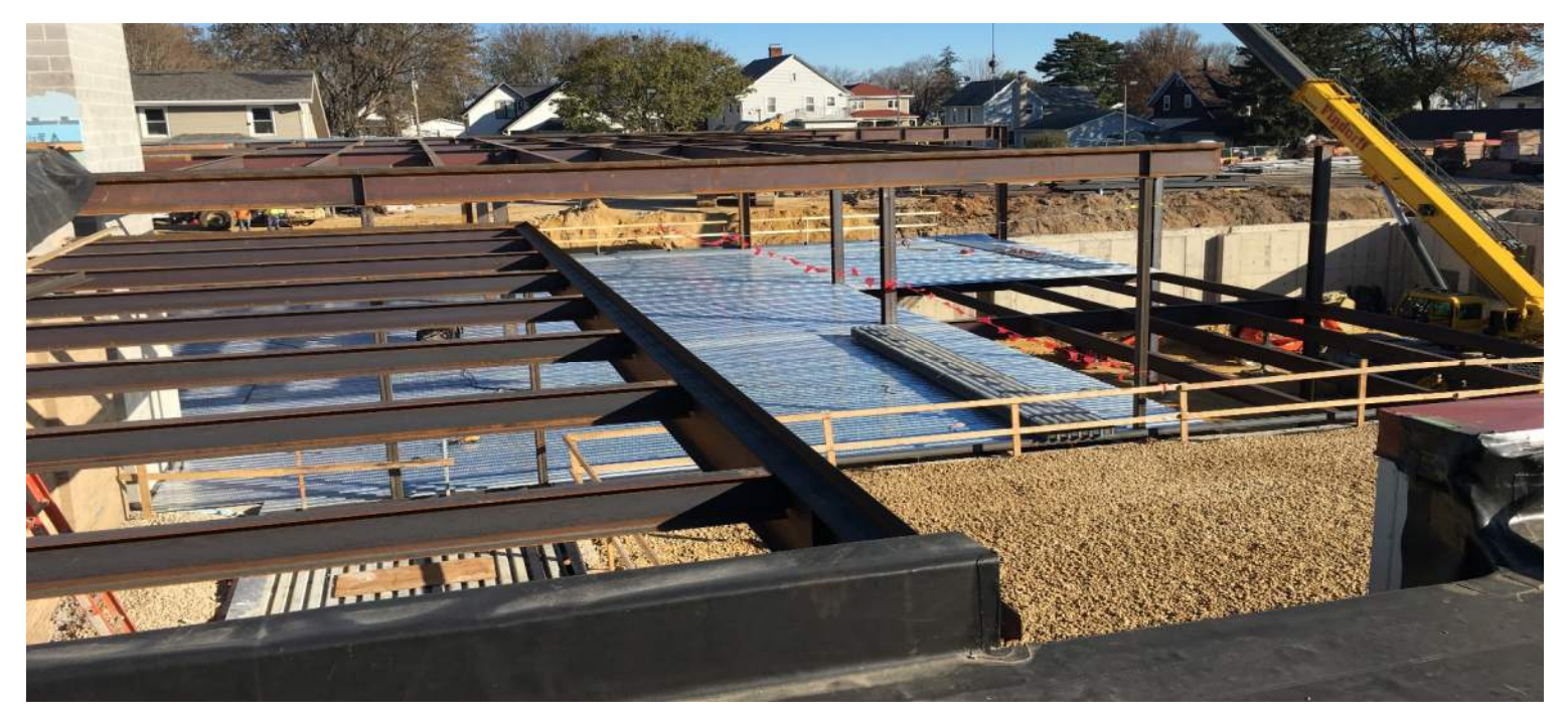
A view from the roof of the steel and deck being installed for the new Clinic / Med Surge addition. Here you can also see the courtyard area that will be accessible from inside of the building. This is located where the gravel is shown in the bottom right corner.