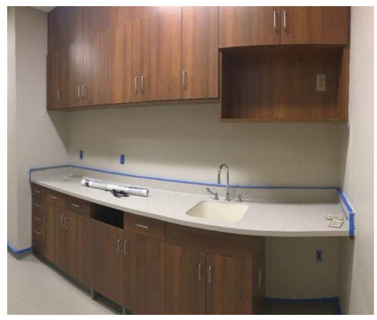
The nourish station that was installed in the Education Area. It will soon receive a few appliances, and the final accessories will be installed.