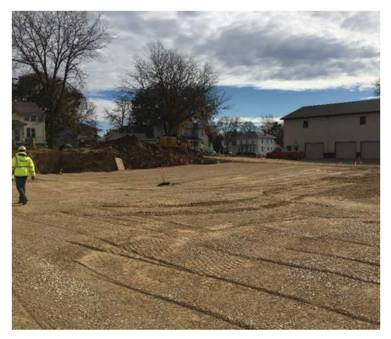
Grading for the new Rehab lot is underway. The final layout and materials for grading were installed last week.