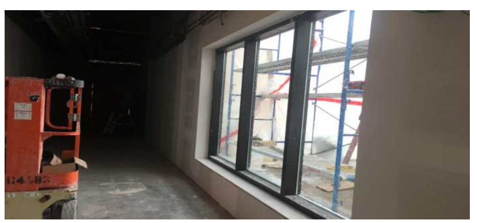
New windows and doors are added in the hallway that leads from the Ambulance Garage to the new Emergency Department.