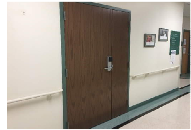
Doors for the new IDF 7 room have been added and the finishes in the area touched up.