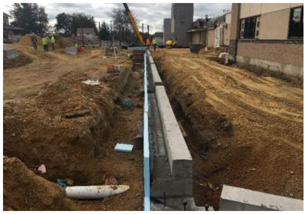
Footings, foundation walls, and underground plumbing is being installed for the new Main Street addition.