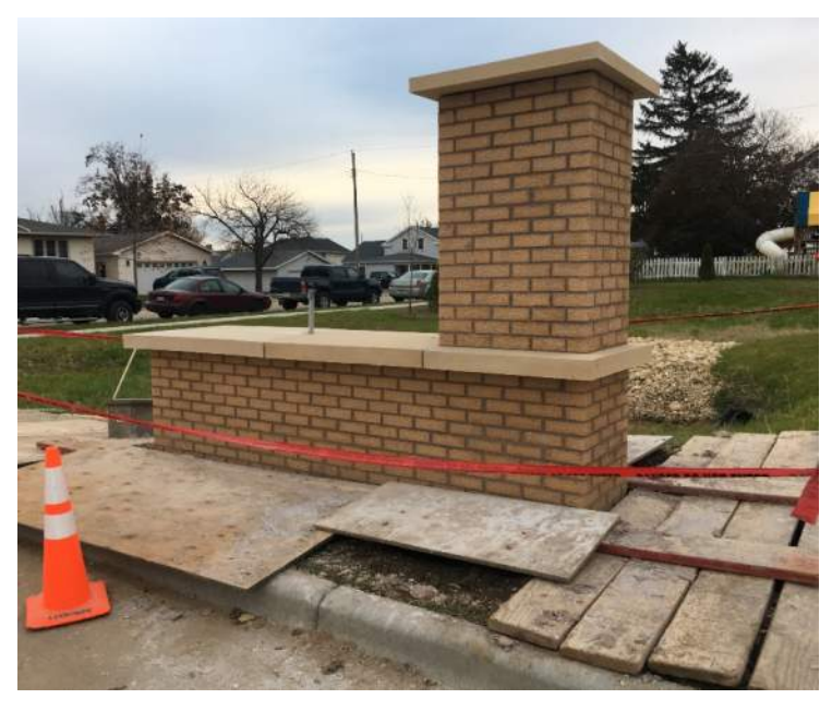
The base for the new monument sign at the North side of GRHC near Oak Street. Soon this sign base will also have the sign to go with it!