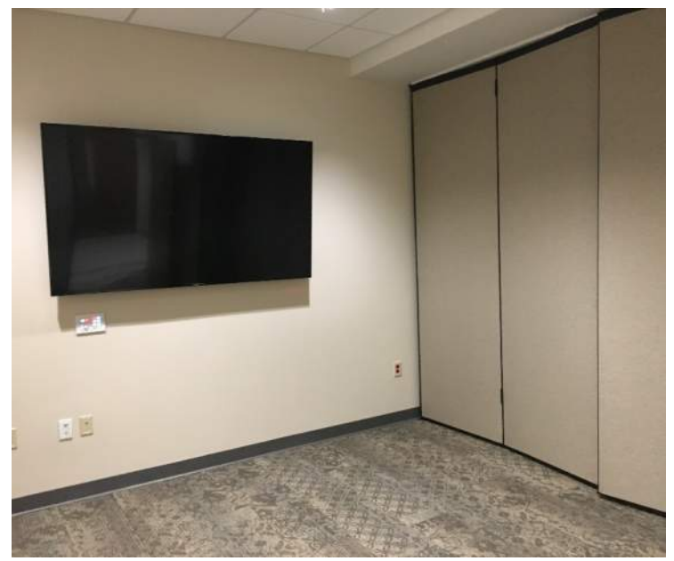
The folding partitions temporarily opened to show what they will help achieve in terms of dividing the classrooms up.